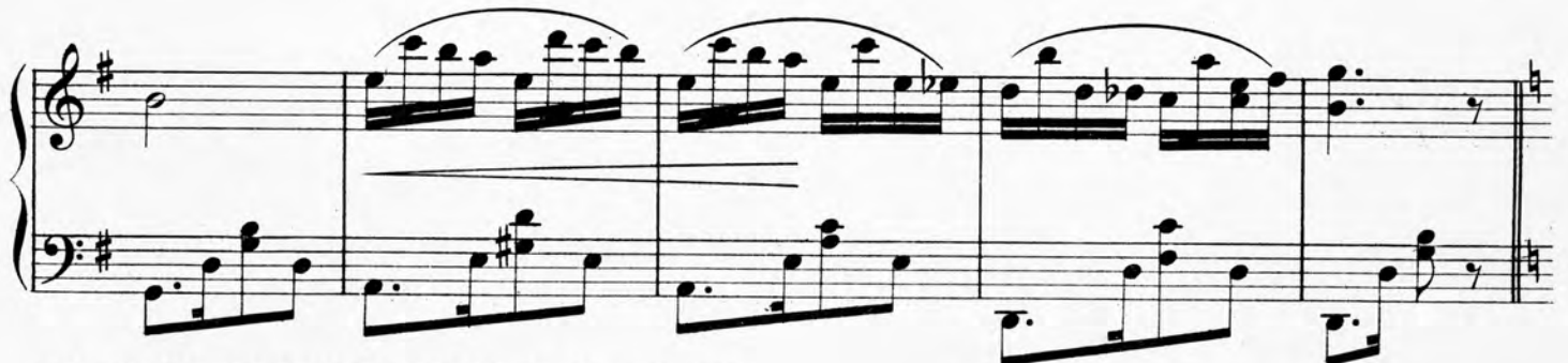
DAMA DE SARAGOSA VALSE, by Renick. 60¢ Hermosillo 4.