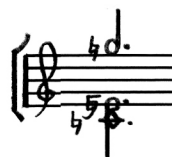
stable double pitch